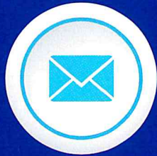
An email address