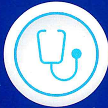
To be registered with a GP